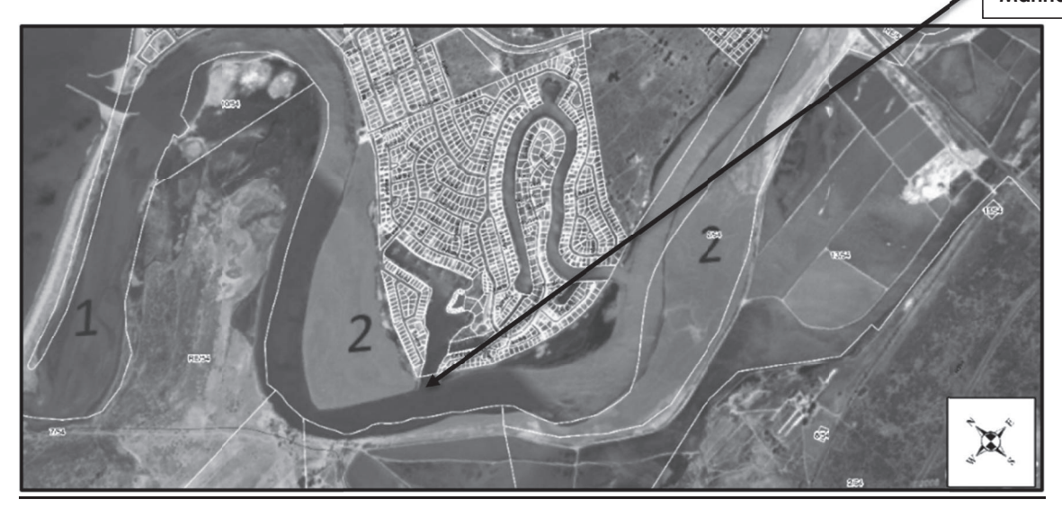
Zone 1 - Old Mouth Lagoon – Covering the water area and salt marshes stretching upstream towards to Zone 2

West/ Main Entrance of the SCHEDULE 1: Port Owen Marina